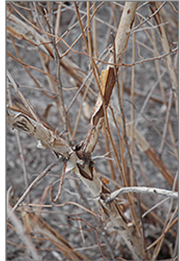
Diablo Ninebark bark

This shrub does best in full sun to partial shade. It is very adaptable to both dry and moist locations, and should do just fine under average home landscape conditions. It is not particular as to soil type or pH. It is highly tolerant of urban pollution and will even thrive in inner city environments. This is a selection of a native North American species.