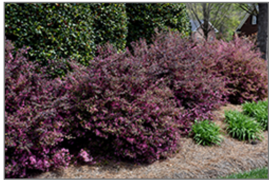
Purple Diamond Fringeflower in bloom