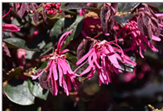
Suzanne Chinese Fringeflower flowers

Suzanne Chinese Fringeflower is recommended for the following landscape applications;