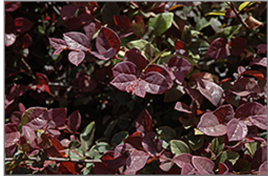
Suzanne Chinese Fringeflower foliage

This shrub does best in full sun to partial shade. It prefers to grow in average to moist conditions, and shouldn't be allowed to dry out. It is particular about its soil conditions, with a strong preference for rich, acidic soils. It is somewhat tolerant of urban pollution. Consider applying a thick mulch around the root zone in winter to protect it in exposed locations or colder microclimates. This is a selected variety of a species not originally from North America.