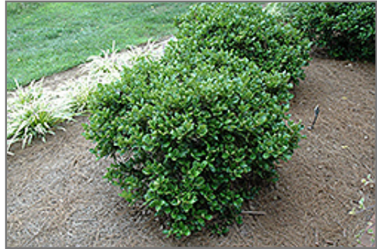
Carissa Holly

Carissa Holly is recommended for the following landscape applications;