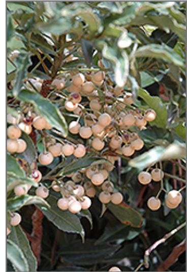
White Coral Berry fruit