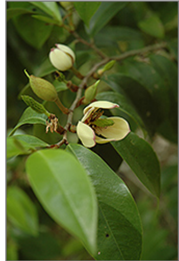
Skinner's Banana Shrub flowers