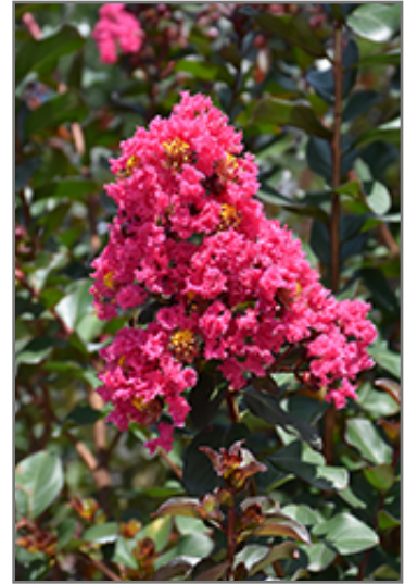
Pink Velour Crapemyrtle flowers