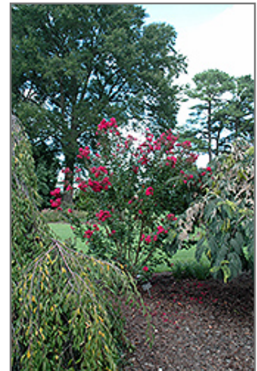
Pink Velour Crapemyrtle in bloom