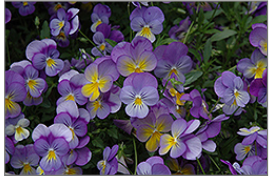
Rebel Blue and Yellow Pansy flowers

Rebel Blue and Yellow Pansy is recommended for the following landscape applications;