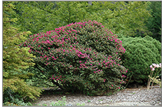
Pocomoke Crapemyrtle in bloom